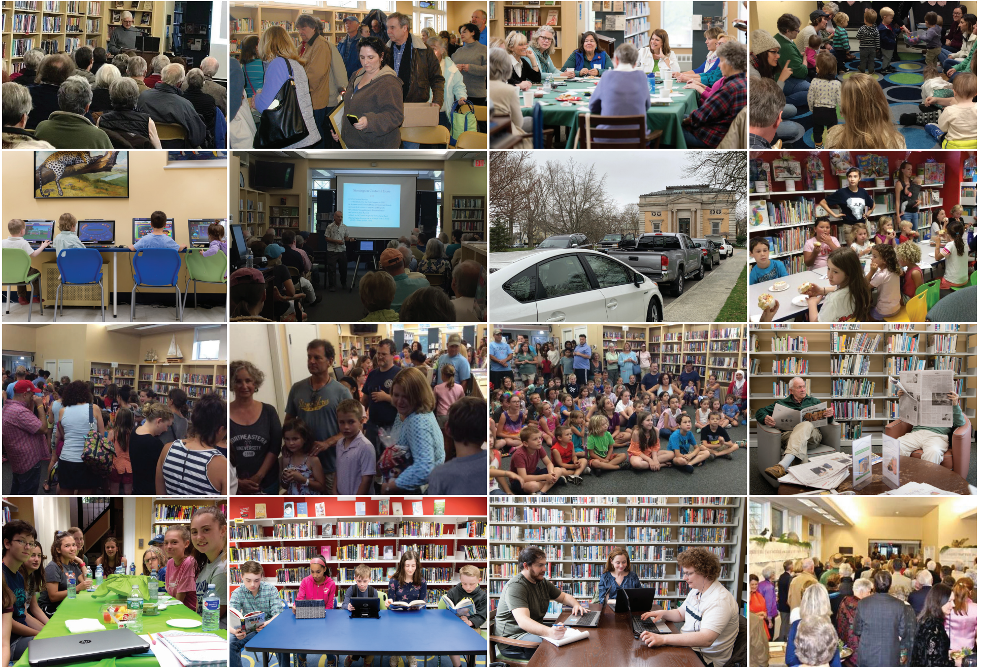
Stonington Free Library Has A Problem (It's The Good Kind, But A Problem Nonetheless)