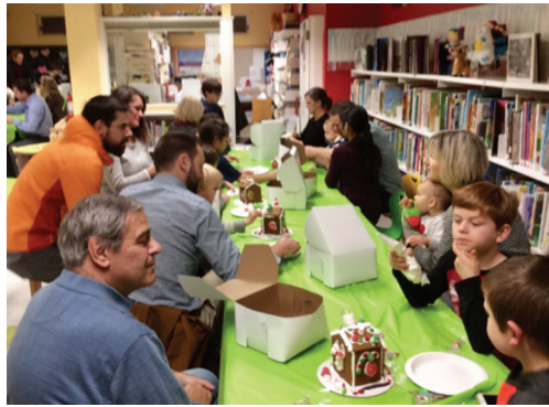
Families enjoy the Holiday Gingerbread House Workshop.