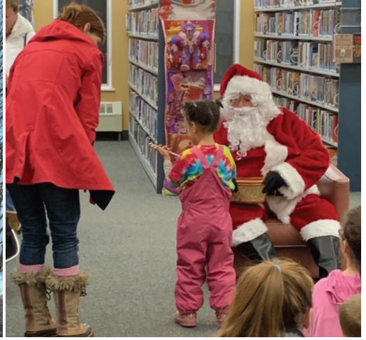
Santa takes photos & hands out candy canes.