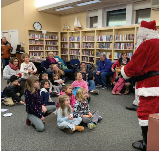
Santa greets everyone after a reading of Twas the Night Before Christmas on the evening of the Holiday Stroll.