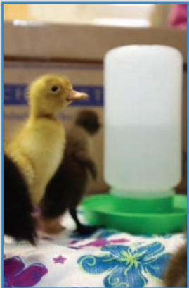
Don’t miss “Duckling Week” March 31–April 5

Terra Firma Farms will generously provide us with an incubator and duck eggs this spring and we look forward to welcoming our newest “patrons” during Duckling Week, March 31—April 5. Be sure to stop in to say hello and check our web site and Facebook page for (shell) breaking news!