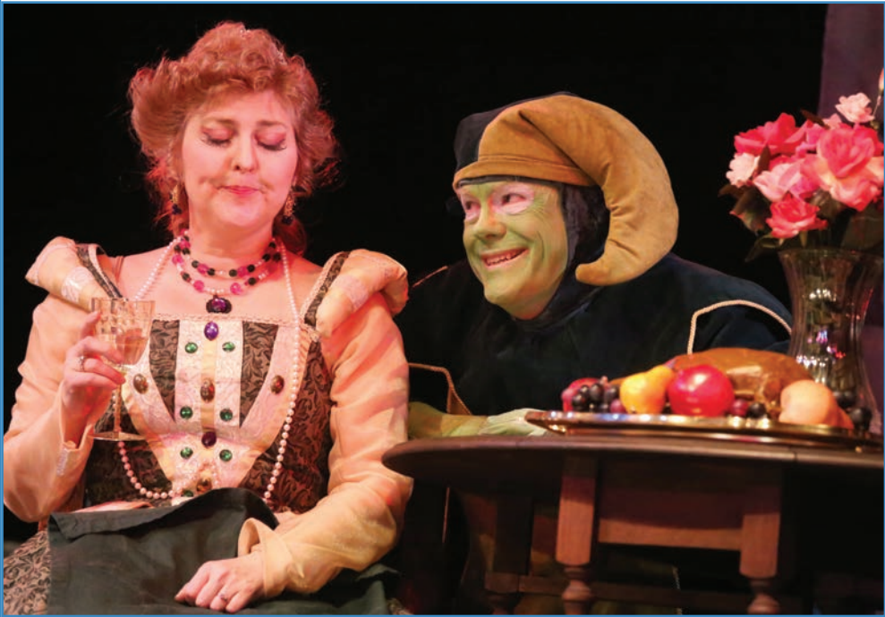
Both performances of our annual Children’s Opera “The Frog Prince” presented by The Lollipop Express Opera Company were sell-outs.

Both performances of our annual Children’s Opera were sold out at The Mystic Stage on January 25. Attendees raved about “The Frog Prince” presented by The Lollipop Express Opera Company! We are so grateful to the Library’s opera aficionado, who so generously underwrites this performance for the children in our own and area communities.