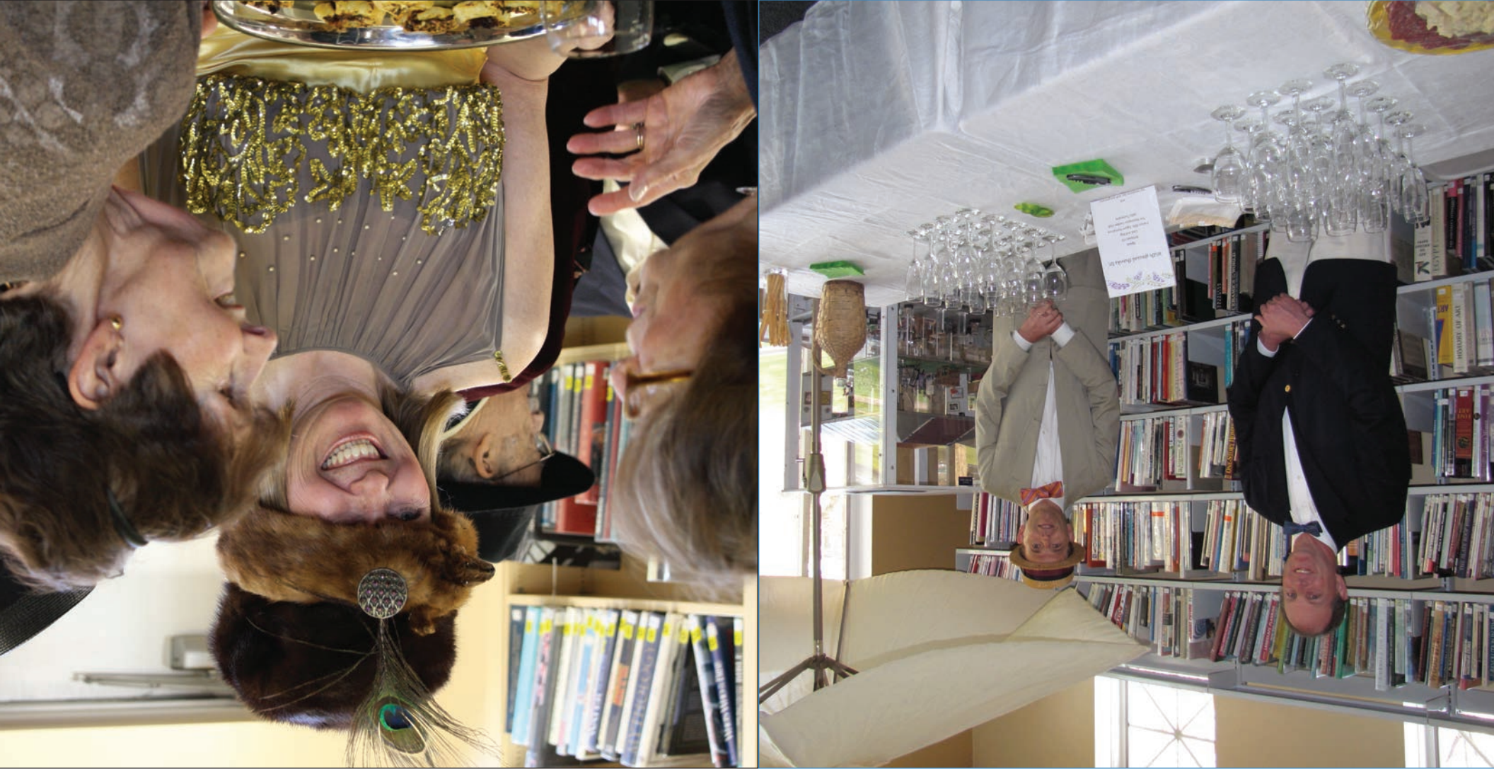
Scenes from last year's Mystery Cocktail Party, "Enchanted April"

No fun like it. This year's Mystery Dinner theme is "Hemingway in Spain". You'll drink Hemingway drinks at the Mystery Cocktail Party. You'll eat a Hemingway dinner at your Mystery Host's. And we hope you'll dress up in a Hemingway way. Invitations go out mid-March. Your ticket will cost what it did last year and the year before and the year before that: a very reasonable $80 per guest, and we're expecting about 140 guests. Watch your mail (or e-mail) for your invitation and return it right away. Everything is first come, first served (of course, we do everything we can so no one has to be turned away).