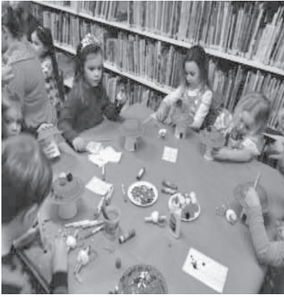
Fairy Party in the Children's Room