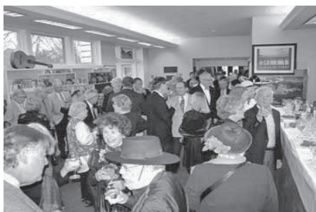
Mystery Dinner cocktail reception at Café Misterioso - aka, the Library