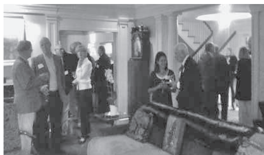
Pediment Society Reception at Stillmeadow Farm