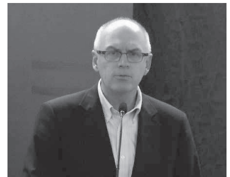
Nathanial Philbrick featured as part of the Sunday Evening Lecture Series