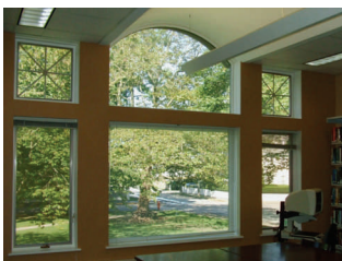
One of the quiet study corners in the library

A book drop, located at the east corner of the library, is available for returning materials when the library is closed. Materials can also be renewed on line at www.stoningtonfreelibrary.org or by phone 860-535-0658.