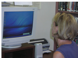
One of our public Internet workstations.

The maximum time available per patron is one hour; additional time may be allowed if no one is waiting.