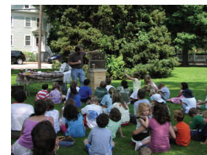
Learning about bees and beekeeping

The Library, working with the Rotary Clubs and the Leslie Buck Memorial Fund, coordinates third grade class visits to the library. Each child receives a dictionary, a library card and an introduction to library services.